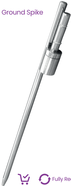
Ground Spike Diagram