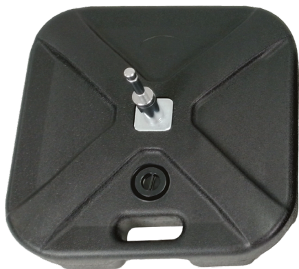
Small Tank Base