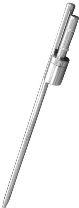
Ground Spike Diagram